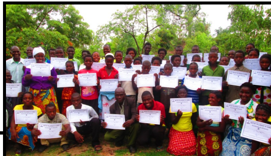
Jordan Baptist Church with Baptismal Certificates