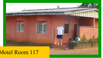
Our home for two weeks...Nyika Motel Room 117

We finally reached what we believed to be our final destination only to learn we had yet one more hour of bumping, swerving, jarring and jostling before arriving at the Nyika Motel where we were to lodge for the next two weeks. Happy to be still we quickly took in our new surroundings excited to have a place to rest our weary bodies. We had a quick carry out dinner (yes even in the bush you can find a restaurant of sorts). We ate and passed out from exhaustion. School meetings were to begin early the next morning. Now in Sinda... the project had officially begun!